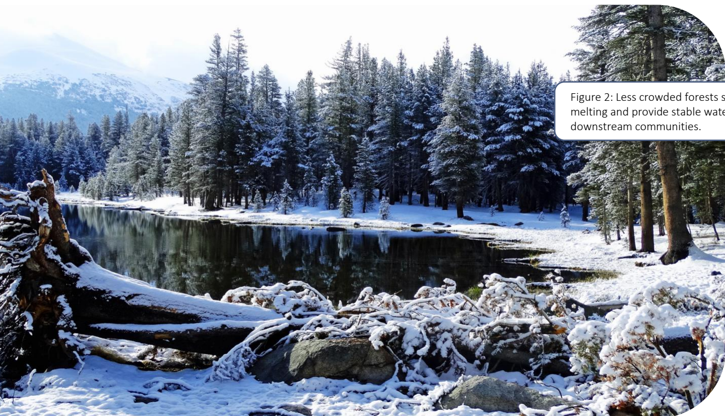
Figure 2: Less crowded forests slow snow melting and provide stable water supplies to downstream communities.

Healthy forests are an integral component of the Sierra Nevada watershed, providing a multitude of benefits to both urban and rural communities. Forests filter and regulate the flow of water, sequester and store carbon from the atmosphere, provide habitats for hundreds of species, provide recreational opportunities, and are a major source of wood products, hydro-electric power, and biomass energy. The Sierra Nevada headwater forests provide up to two-thirds of California's water, half of the state's annual timber yield, and 15% of the state's energy demand with additional capacity to provide more renewable energy through biomass, solar, and wind power.