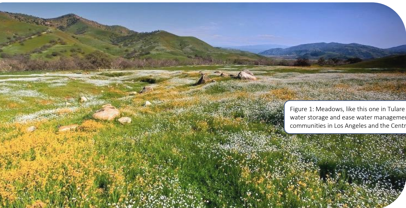
Figure 1: Meadows, like this one in Tulare County, provide water storage and ease water management for downstream communities in Los Angeles and the Central Valley.

The Sierra Nevada meadows play a vital role in controlling floods, capturing carbon, reducing erosion, and regulating water storage, quality, and temperature, as well as providing iconic aesthetic and recreational value to the Sierra region. However, according to the Sierra Meadows Strategy report, approximately 40-60% of meadows have been degraded or are not fully functioning x . The source of meadow degradation can be traced back to multiple stressors including overgrazing, road construction, the state's altered fire regime, invasive species, development, recreational use, and climate change.