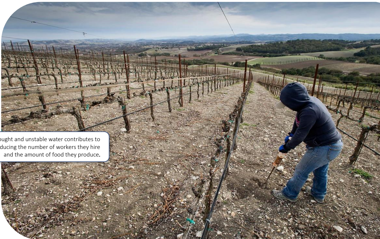
Figure 4: Drought and unstable water contributes to farmers reducing the number of workers they hire and the amount of food they produce.

Furthermore, streamflow from snow-dominated basins are arriving progressively earlier in the season than what has been historically observed, and rain is projected to be increasingly common in upland areas in place of snow. lv The amount of runoff during summer months will still decrease as the increase in rainfall is not expected to offset the loss of snowmelt. lvi Consequently, the state is more vulnerable to