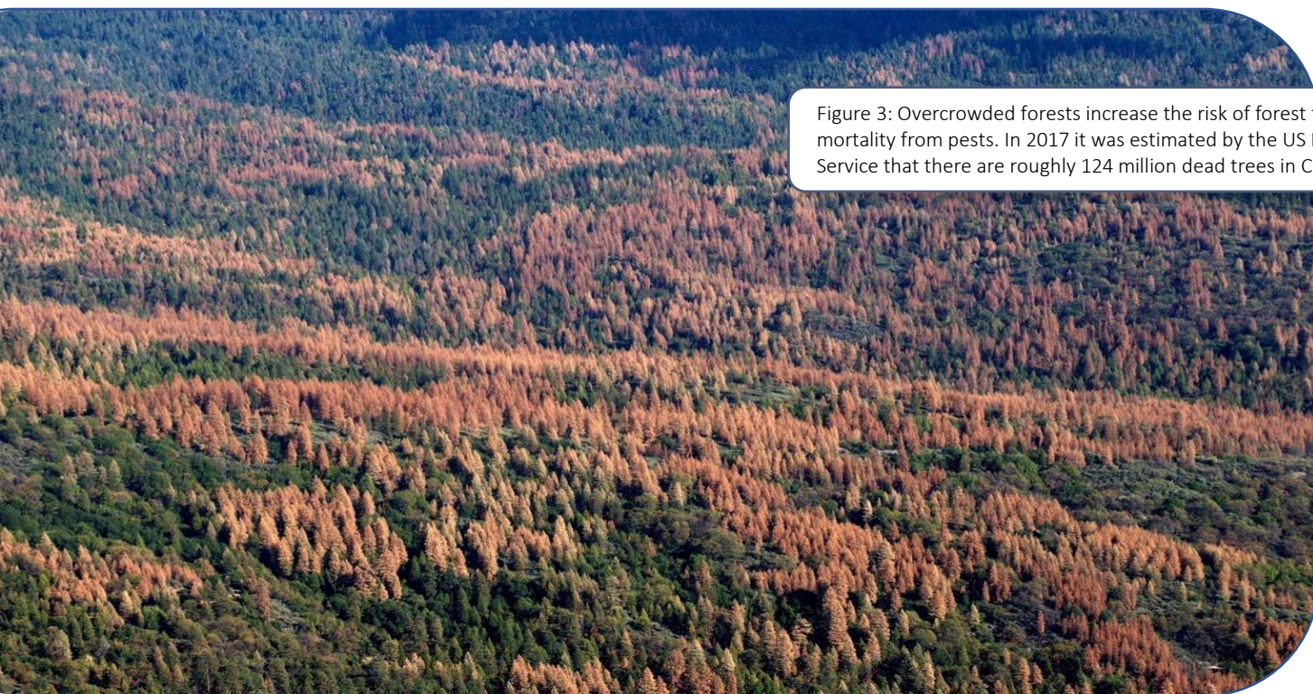
Figure 3: Overcrowded forests increase the risk of forest fire and tree mortality from pests. In 2017 it was estimated by the US Forest Service that there are roughly 124 million dead trees in California.

health by removing ladder fuels and reducing plants' competition for water and other nutrients, crown fires often devastate forest ecosystems by killing great quantities of larger and older trees and sterilizing soil. xxx