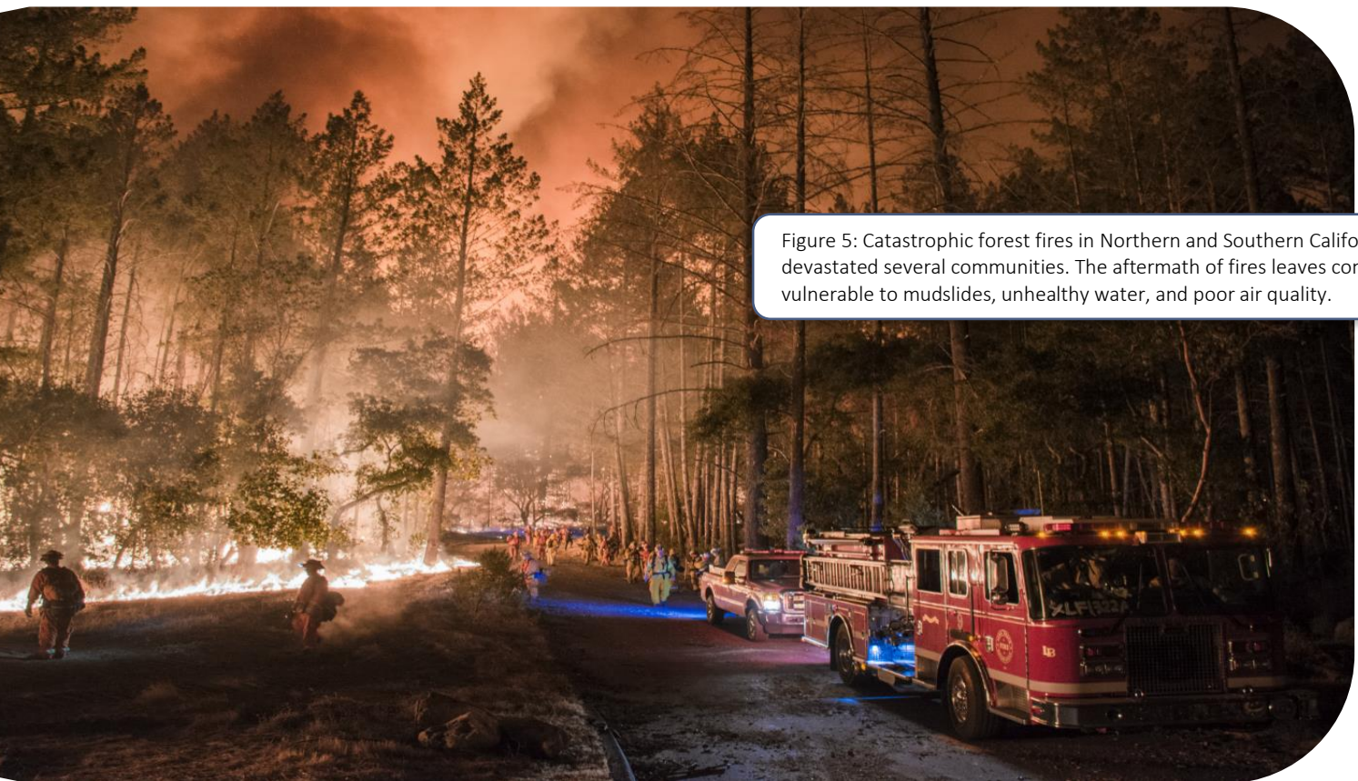
Figure 5: Catastrophic forest fires in Northern and Southern California devastated several communities. The aftermath of fires leaves communities vulnerable to mudslides, unhealthy water, and poor air quality.

One study valuing the loss of ecosystem services from the 2013 Rim Fire estimated between $100 million and $736 million in damages to services like carbon sequestration, air quality, biological control, and water regulation. lxiii The Sierra Nevada Conservancy estimated at least $136 million in recovery costs with no exact amount on habitat destruction, loss of income from tourism, and the destruction of working lands. lxiv That same year was the first time in history the USFS spent over half of its budget on fire suppression by the end of August. lxv The economic burden of fighting fires reduces the funds available for restoration projects and comes at a cost of lives lost, public health impacts, damage to infrastructure, and a loss of valuable ecosystem services the Sierra Nevada provides to both urban and rural communities.