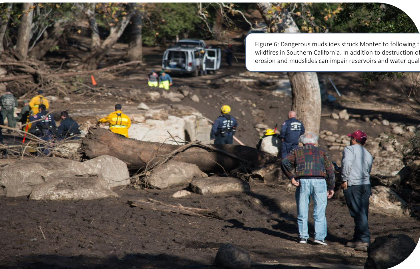
Figure 6: Dangerous mudslides struck Montecito following the severe wildfires in Southern California. In addition to destruction of homes, erosion and mudslides can impair reservoirs and water quality.

During periods of drought, groundwater use will likely intensify, which can result in a permanent loss of storage capacity and damage to infrastructure, including flood management and transportation facilities. lxxiv The compounding effects of a low snowpack and dry seasons will concentrate contaminants such as heavy metals, industrial chemicals, pesticides, sediments and salts. Once contaminated, groundwater can be difficult to clean and may not be suitable for its intended use.